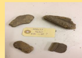
Farnham Ware pottery AD 150