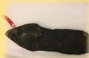
A leather shoe sole