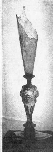
An English wine glass with a lion mask, from about 1620