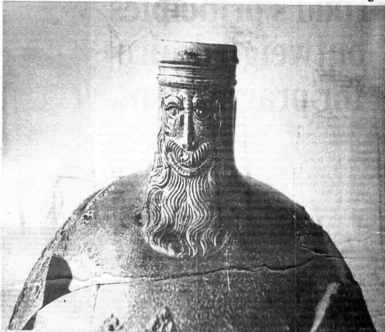
A face mask on the neck of a Bellarmine flagon which dates from about 1620. It is one of several examples of German stoneware found