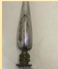
The stem was mended over 300 years ago with gilded wire

One of the most important collections is the Venetian Glass that was sent to Hugh Wilmot at Sheffield University to be analysed; we are in the process of ensuring it is kept as a collection that can be viewed by our members and by members of the public for research purposes.