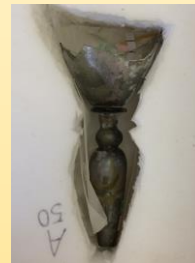
Venetian wine glasses