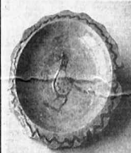
A slipware plate bearing a bird motif, dating from about 1720