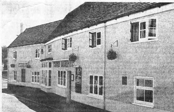
The Three Mariners, close to the site of its predecessors, was converted from three cottages in 1720

The finds from the site will eventually go on display in a local museum.